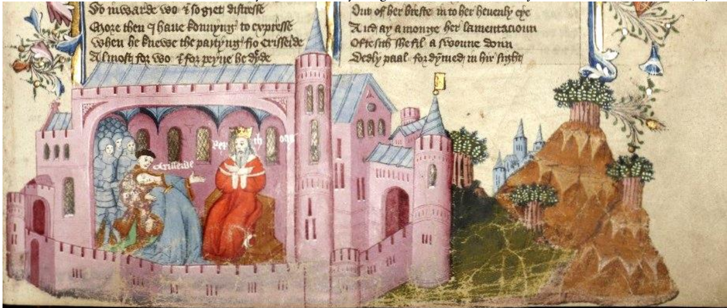
John LYDGATE, Troy Book , Manchester, John Rylands Library, MS English 1, fol. 102r. England, c.1450.